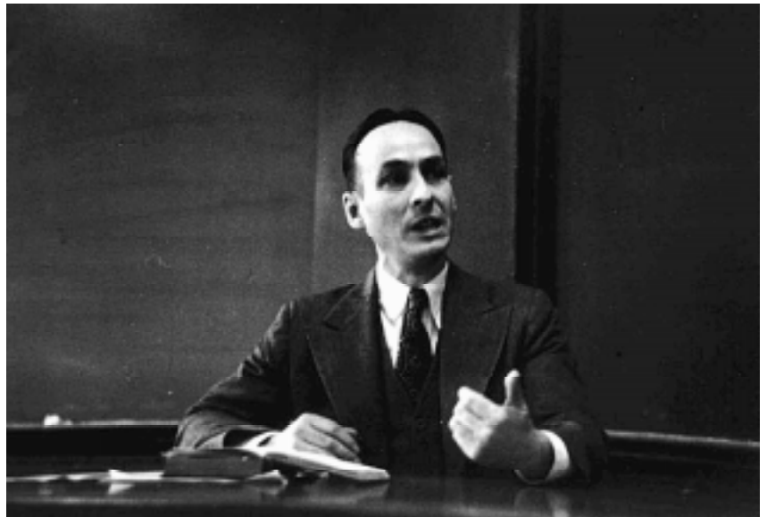
Norman Maclean teaching as a professor at the University of Chicago, 1933.

From 1952-62, Maclean was Chairman of the Committee on General Studies in Humanities, which he founded. He loved teaching